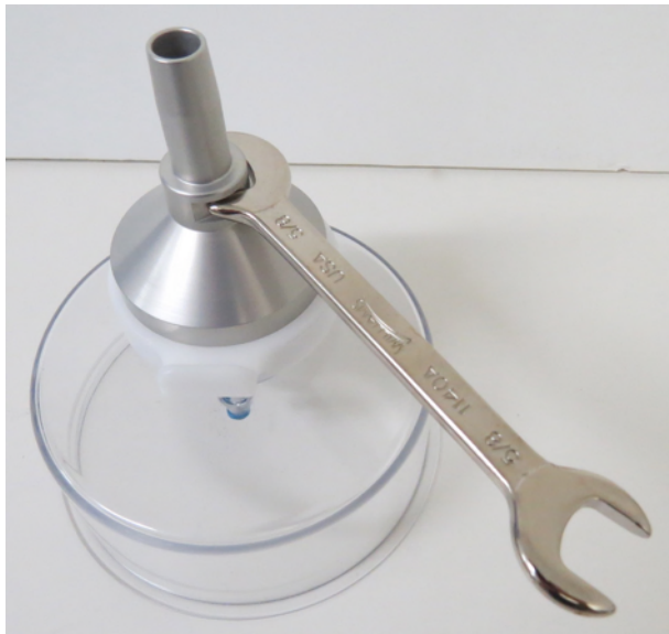
Tighten Inlet Adapter with 5/8" Wrench. Tighten until Inlet Adapter is Seated Firmly on Retention Ring.

WARNING: DO NOT OVERTIGHTEN or RCG Dome Threads may Be Damaged.