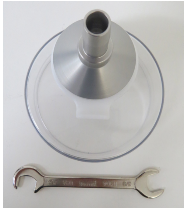
Check alignment of Retention Clip to Center of Dome. Loosen Inlet Adapter and Realign if required.

WARNING: DO NOT OVERTIGHTEN or RCG Dome Threads may Be Damaged.