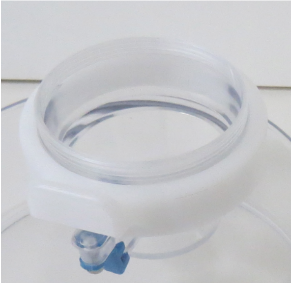
Place Retention Ring Over Dome Inlet. Align Retention Clip Center over Distance Gauge